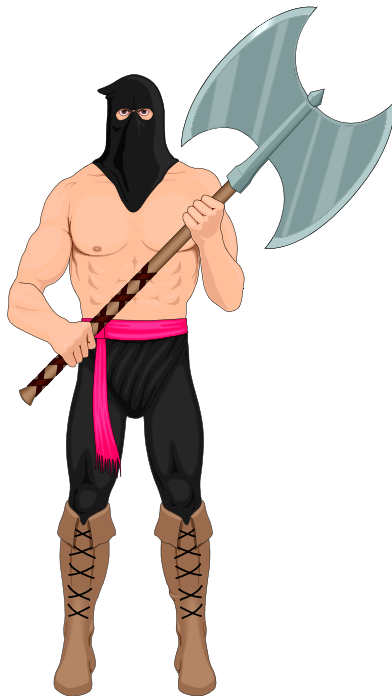
Right Not to be Punished in an