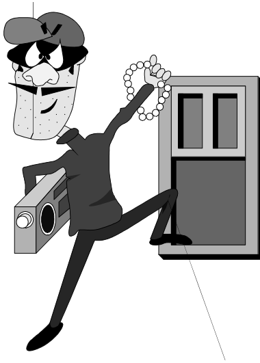
Right to Get Help When in Trouble with Police