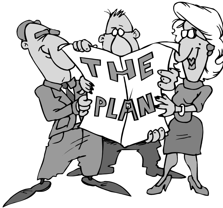
Freedom to Get Together for Meetings