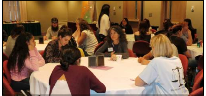
Participants brainstorm ideas to alleviate school pushout.