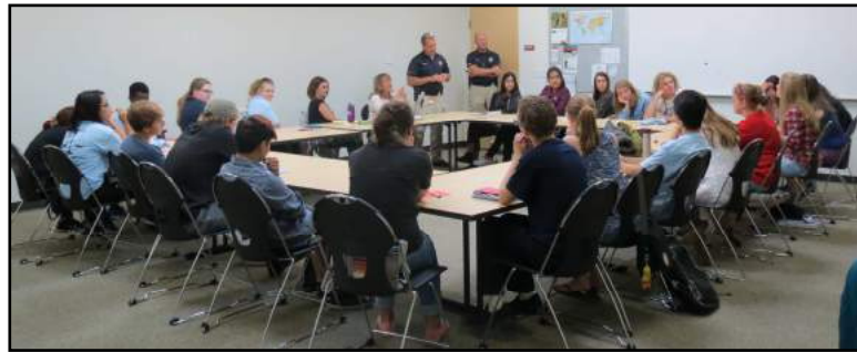
Q & A breakout session with school resource officers during Restorative Justice Day.

Salt Lake Peer Court is an organization that changes lives each day. Peer Court's restorative justice program allows for great personal growth in both youth offenders and peer mentors alike. By using a system that focuses on harm and repair,