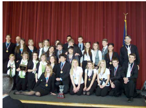
Sky View High School; 2011 We the People First Place Winners

The 2012 State High School Mock Congressional Hearings will be held February 13 at the Utah State Bar Law and Justice Center. Questions for the 2012 state high school competition may be downloaded at http://www.civiced.org/index.php?page=simulated_congressional_hearings#resource .