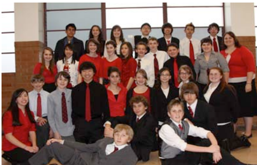
Pictured above are the Midvale Middle School Mock Trial Teams.

The 2011 High School Championship teams were Mountain View High School, 1 st place, and City Academy, 2 nd place. Kaysville Junior High School placed 1 st in the Junior High Division, with Midvale Middle placing 2 nd .